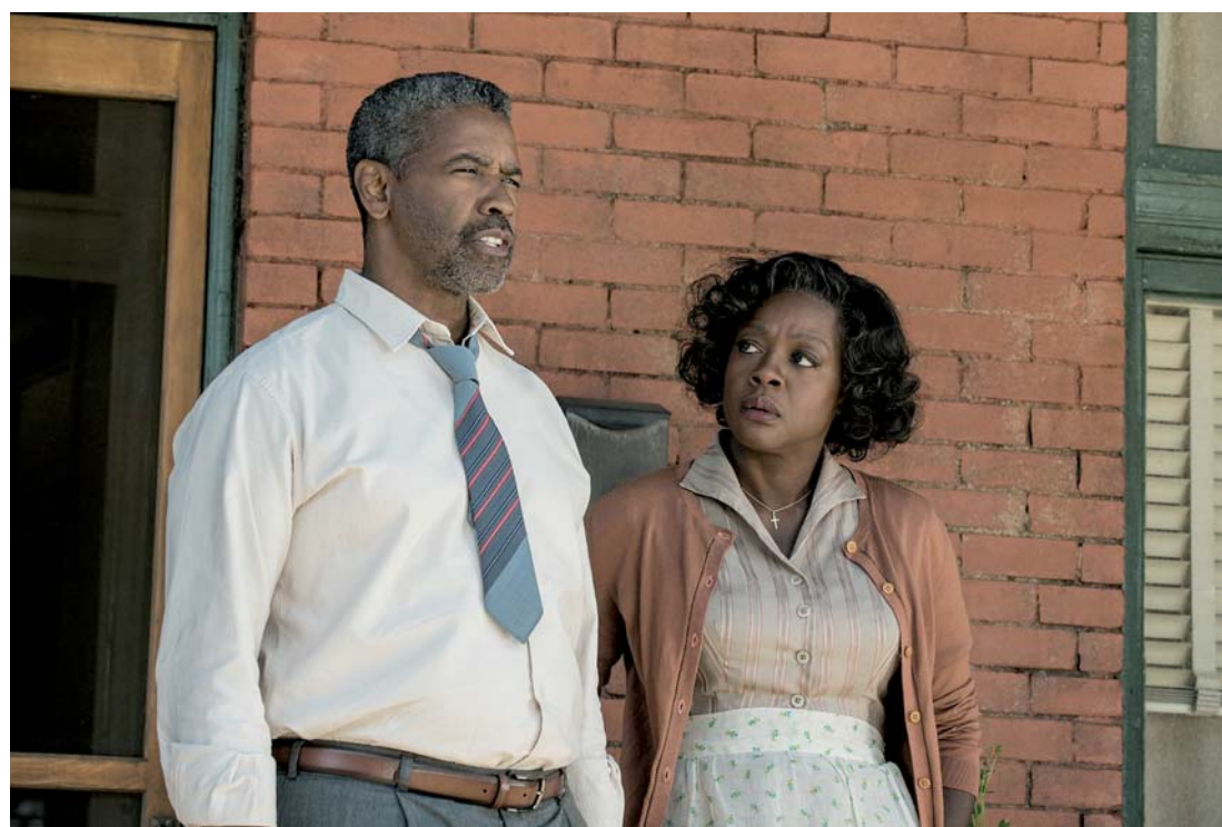
Denzel Washington and Viola Davis star in "Fences."