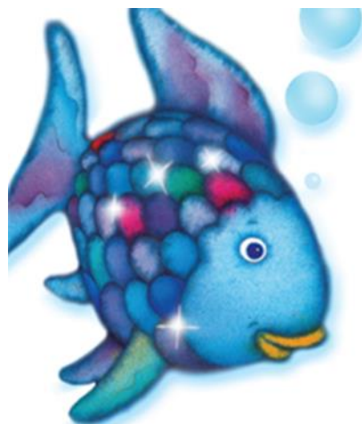
THE RAINBOW FISH

Performances: Friday, December 15 - Monday, December 18, 2017